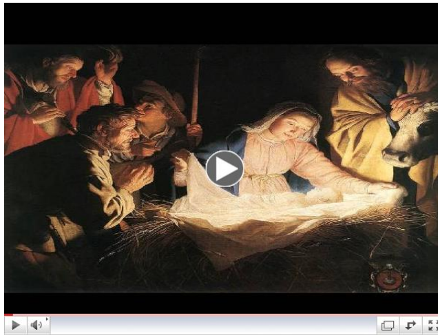
J.S. Bach - Christmas Oratorio, BWV 248 / Chorus: "Jauchzet, frohlocket" (Ton Koopman)