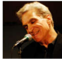
Robert Pinsky U.S. Poet Laureate

an enchanting musical conversation between poetry & jazz