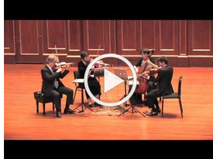
Borromeo Quartet Schubert "Death and the Maiden" I

A trio that includes members of the Borromeo Quartet with pianist