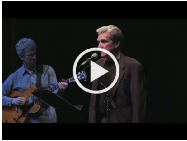
Robert Pinsky's PoemJazz