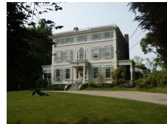
outside of Fellowship Hall

For Special Parish Meeting, the 4th of December, 2022 at 12:00 p.m. in the Old Ship Meeting House and via Zoom