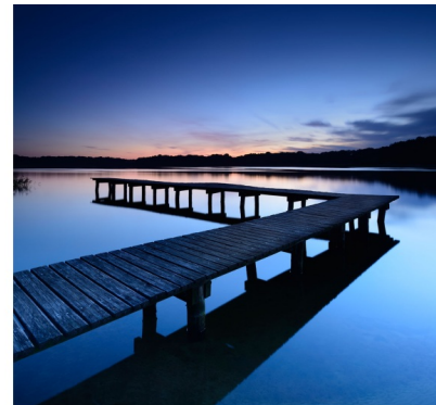
VESPERS AT OLD SHIP CHURCH

107 main street hingham, Ma. 6:30 Wednesdays Dec. 1, 8, 15, 22 Imagine stepping back into 1681. A candlelit church, vaulting timbers hundreds of years old, and a half hour of listening and being. We hear words of peace and comfort, music that lifts us, and silences that invite our inner thoughts to come forward as we listen to the settings of this ancient Meetinghouse. Join us for this time of beauty and peace. (Socially distanced. Masks required)